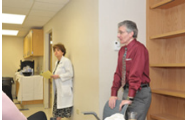
Staff & Faculty Enjoy Welcome Breakfast

News You Can Use: New C.R.I.S.I.S. Program From Work-Life Connections More Information . . .