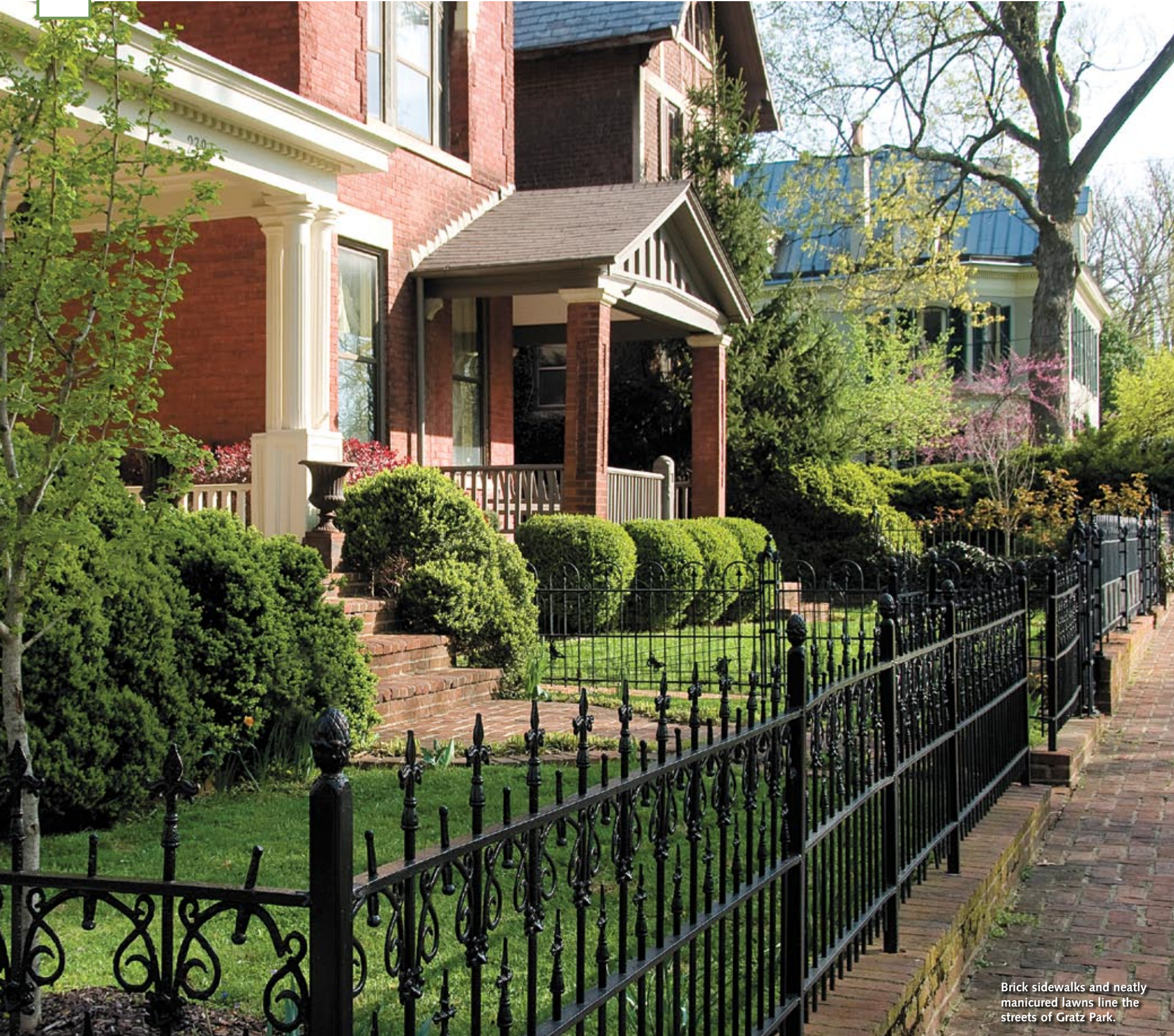
Brick sidewalks and neatly manicured lawns line the streets of Gratz Park.