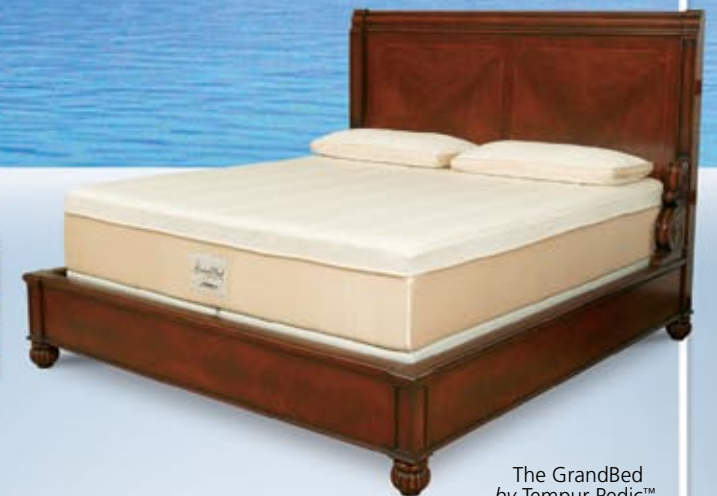
The GrandBed by Tempur-Pedic™

Imagine a place that brings you pleasure. A place that comforts you like no place else. And what if you could go there tonight... and every night.