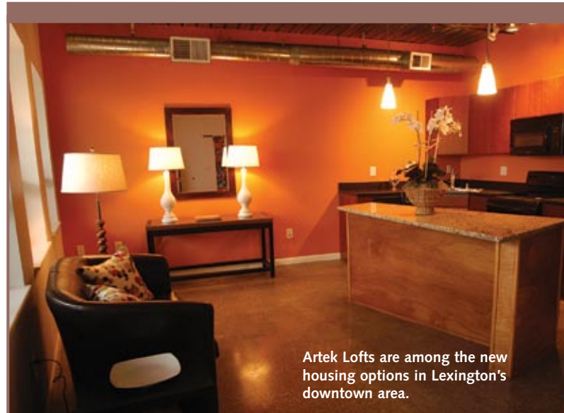
Artek Lofts are among the new housing options in Lexington's downtown area.