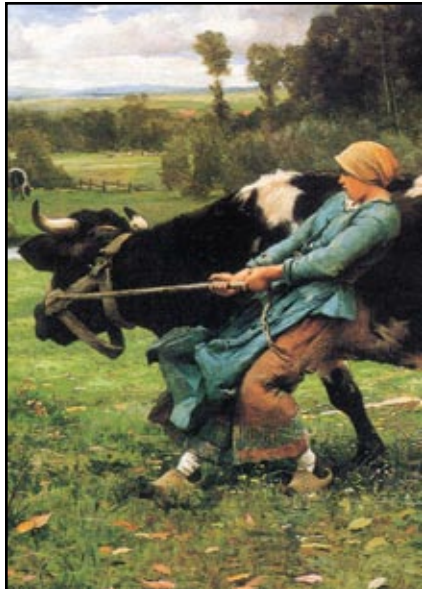
JULIEN DUPRÉ, In The Pasture (detail), c. 1883, oil on canvas