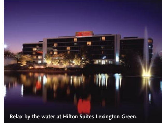
Relax by the water at Hilton Suites Lexington Green.

The Spa at Griffin Gate or a round of golf on a course designed by Rees Jones. After a full day, retreat to your guest room and rest well with plush bedding and plenty of fluffy pillows.