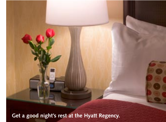
Get a good night's rest at the Hyatt Regency.

banquet space, this hotel is fit for any business or social gathering. But it's right for getaways, too: Guests can explore the shops at nearby Victorian Square (connected by a covered skywalk), then enjoy dinner and a cocktail at Bigg Blue Martini before relaxing in Sleep Number beds. In the morning, have breakfast at Café on the Park, which has a view of Triangle Park.