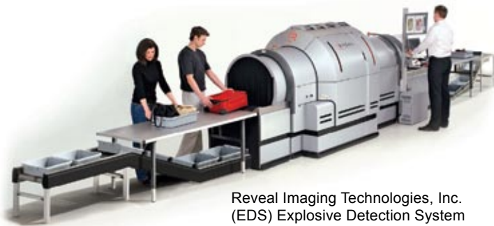
Reveal Imaging Technologies, Inc. (EDS) Explosive Detection System