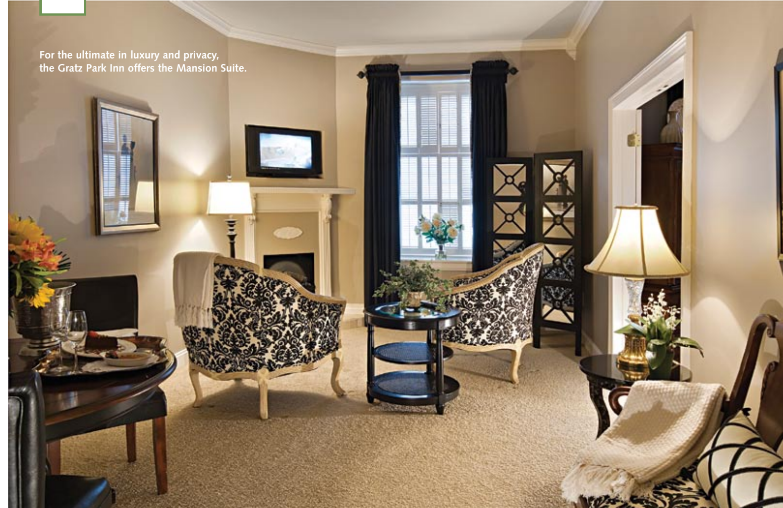
For the ultimate in luxury and privacy, the Gratz Park Inn offers the Mansion Suite.