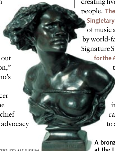
A bronze bust by French sculptor Carpeux at the University of Kentucky Art Museum.