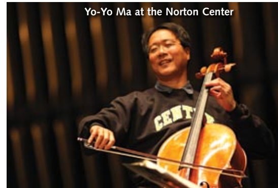
Yo-Yo Ma at the Norton Center

The home of collections in photography and art ranging from Old Masters to abstract expressionists,