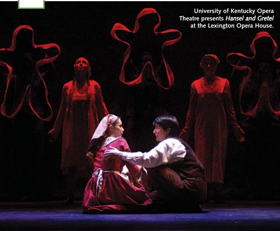
University of Kentucky Opera Theatre presents Hansel and Gretel at the Lexington Opera House.