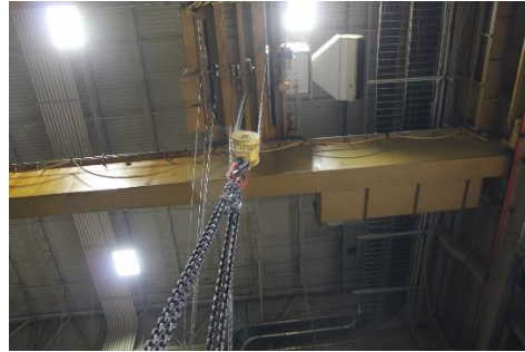
Figure 3. Bridge crane on site.