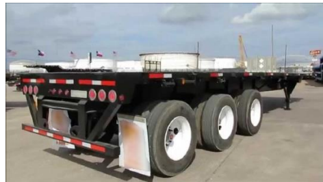
Figure 4. Stock image of tri-axle flatbed trailer occurred.