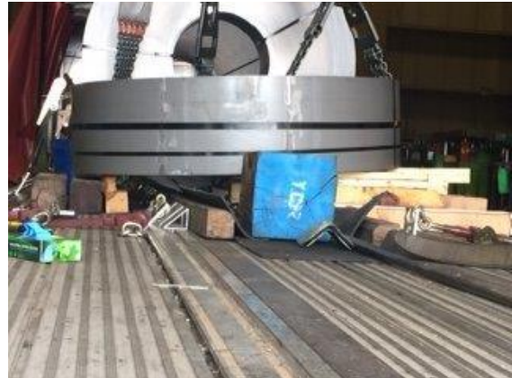
Figure 8. Steel coil that fell on and crushed truck driver, on flatbed trailer.

The crane operator turned away from the coils and crane and proceeded to exit the bed of the trailer. As he exited the truck bed, he actuated the controls of the crane to move it up and away from the coil. Moving vertically, the crane began drawing the sling through the center opening of coil. Suddenly the crane operator heard a noise and turned to see what happened. The sling, though disconnected, had become snagged in part of the coil's eye, and the upward motion caused the coil to topple over onto the truck driver (Figure 8). The crane operator immediately radioed for the company's internal emergency response team to report to his area. The response team arrived to find the truck driver pinned face down on the bed of the truck by the 7.6 ton steel coil. The coil struck the truck driver across his posterior thoracic area, coming to rest on his lower lumbar region and legs (Figure 9).