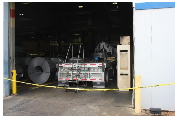
Figure 2. Loading area where incident occurred.

The incident scene was a steel receiving metal warehouse where steel coils were loaded and unloaded onto tractor trailers. The truck and trailer were at a loading dock.