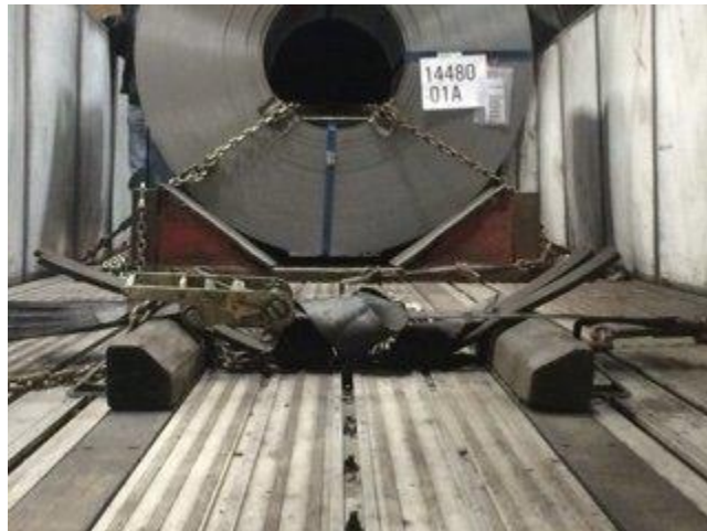
Figure 6. The flatbed trailer where the coils were to be loaded.

tons, and rested on two 4"x4" hardwood posts. The truck driver and the bridge crane operator removed three of the five steel coils (Figure 7B) before loading the first of the 3 coils that were to be shipped out (Figure 7C). Next, the crane operator used the bridge crane to remove the remaining two coils from the flatbed trailer that were to be delivered (Figure 7D) before proceeding to load the second steel coil to be shipped