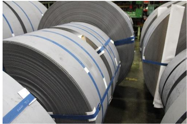
Figure 1. Photo of steel coils at the jobsite.

On Monday, October 26, 2015, a 46-year-old truck driver (the victim) and a bridge crane operator were loading three 7.6 ton steel coils onto a flatbed semi-trailer, using a bridge crane. The truck driver was standing on the bed of the trailer and both he and the bridge crane operator had their backs turned to the bridge crane, while the crane operator actuated the crane's controls. The crane's sling became entangled in the eye of a steel coil, causing it to become unstable and topple over onto the truck driver. The truck driver was pinned to the bed of the trailer beneath the steel coil and died at the scene.