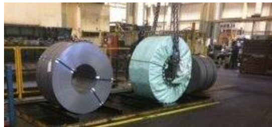
Figure 5. Steel coils in the loading area secured to the bridge crane sling.