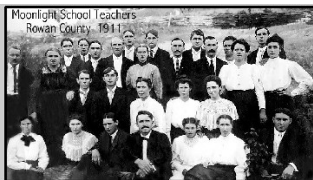
University of Kentucky Archives

analyze and interpret the past. The session focuses on some of the myths and misconceptions about the Moonlight Schools and includes a visit and tour of Morehead's Moonlight School.