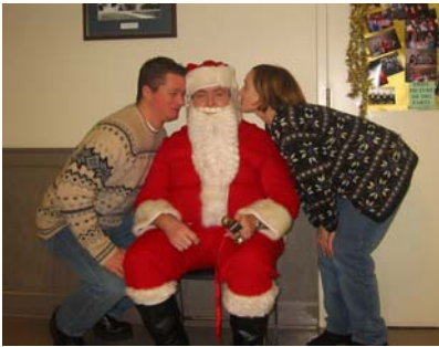
"We love you, Santa!"