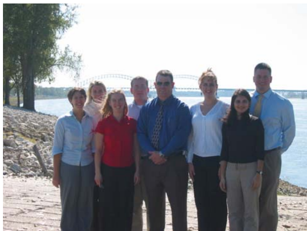
On Tour in Memphis, the Specialty Resident PDE 2003

Each year the specialty residents and pharmacy practice residents each depart on a voyage of discovery, the Professional Development Experience (PDE). The PDE was developed as a means for UK residents to observe practices at other institutions, and share ideas among colleagues. In October the Specialty Resident Class visited the Vanderbilt Medical Center in Nashville, Regional Medical Center, St. Jude Children's Research Hospital, University of Tennessee at Memphis, and the University of Alabama at Birmingham. In November the Pharmacy Practice Residents are headed to Detroit Receiving Hospital, William Beaumont (Royal Oak, MI), and the University of Michigan. These opportunities allow the residents to create a network of resources, and to participate in roundtable discussions with residents and preceptors from other sites. Through these experiences we hope to open the doors of communication among residents, and promote the exchange of ideas and thoughts on issues we face in clinical pharmacy practice.